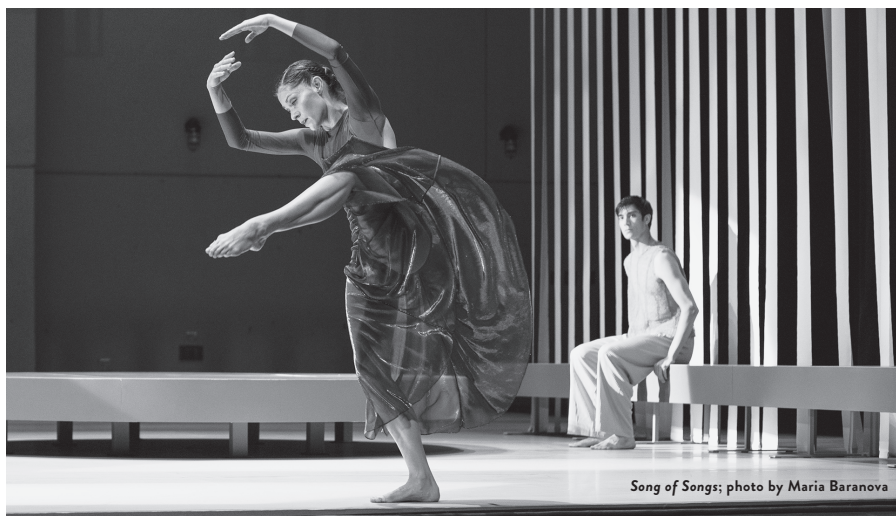
Song of Songs