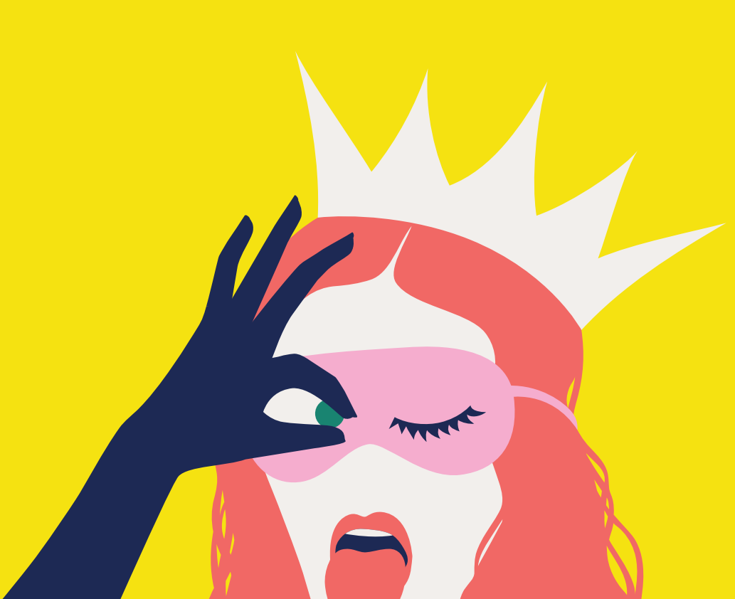
JAN 24 - FEB 4, 2024